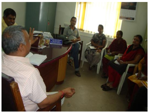
The Nodal Officer sharing the observations with the district authorities