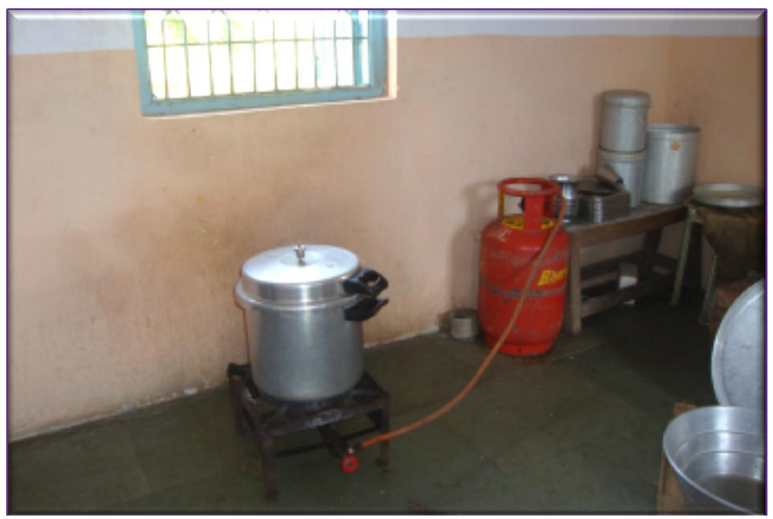
Facility of cooking fuel and cooking utensils.