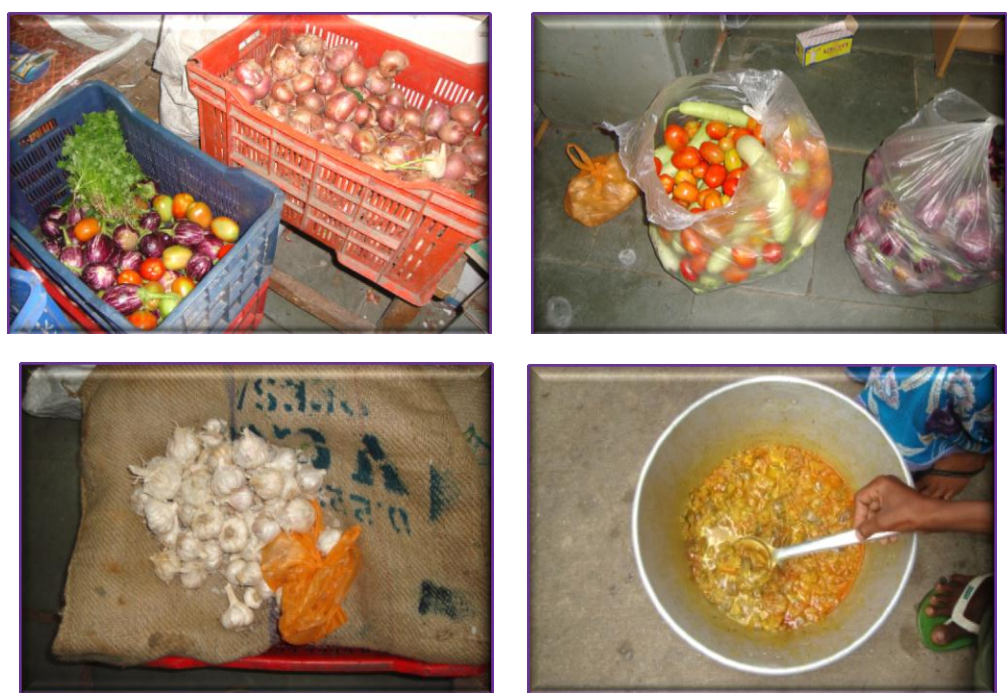
Fresh vegetables and spices used in preparation of MDM.