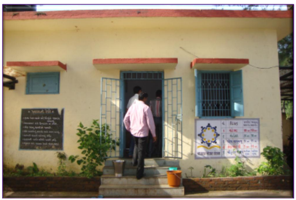
Well maintained kitchen shed at GMS Patlara.

There were 5 schools (School no. 4, 20, 21, 22, 23) where kitchen shed was not available.