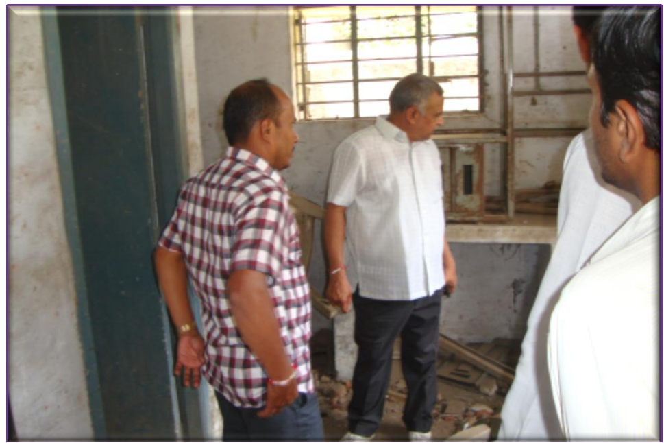
Kitchen shed not maintained and not used at GMS Dhabel.