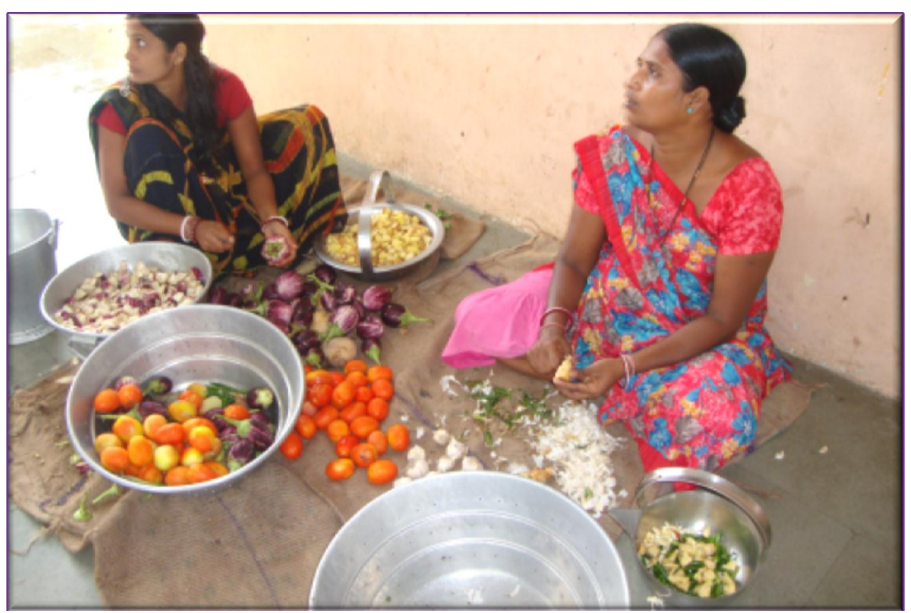
Cooks and helpers making preparations for MDM.

There was 1 cook cum helper (SC), 51 cooks (29 OBC, 18 ST, 3 SC, 1 GEN.) and 59 helpers (38 OBC, 14 ST, 7 SC).