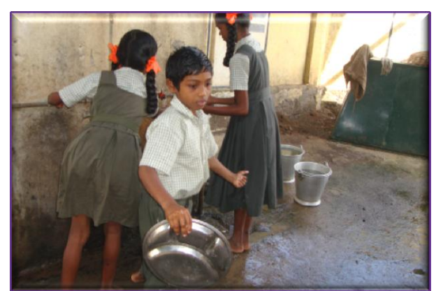
Students washing their hands and rinsing utensils before and after MDM.