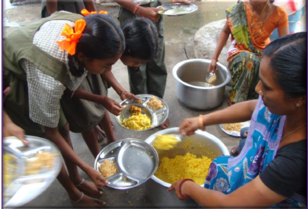
Systematic serving and seating arrangements during MDM.

ii. Did you observe any gender or caste or community discrimination in cooking or serving or seating arrangements?